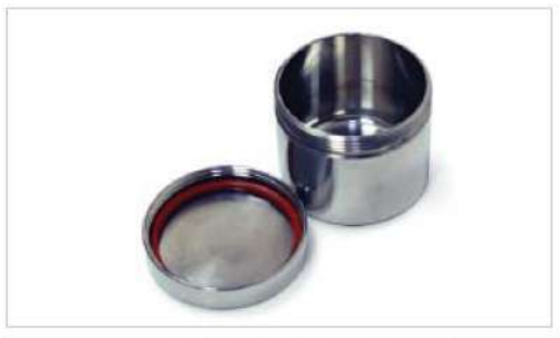
Mini-Pots can be fitted with a silicone O ring. This makes the sealing more robust. The silicone is FDA compliant to CFR 177.2600.