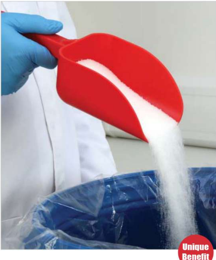
Cleanroom Manufacture All our scoops are manufactured and packed in a cleanroom