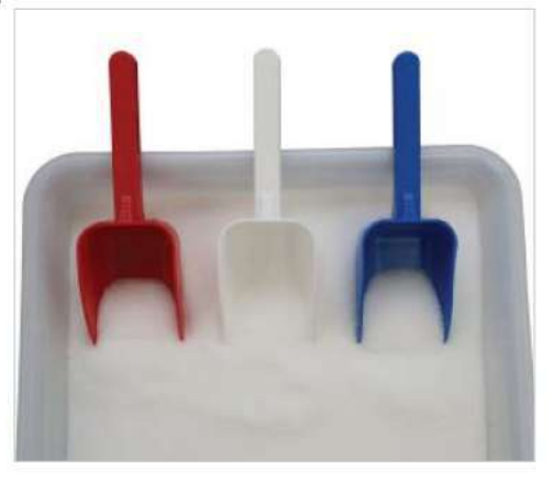
Don't forget your scoop! A brightly coloured scoop can be easily seen.